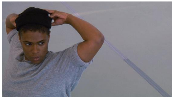
(Press images as downloads are available here.)