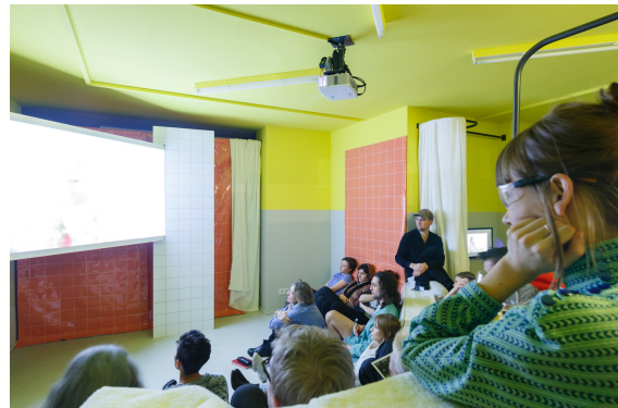
12 Moons Film Lounge